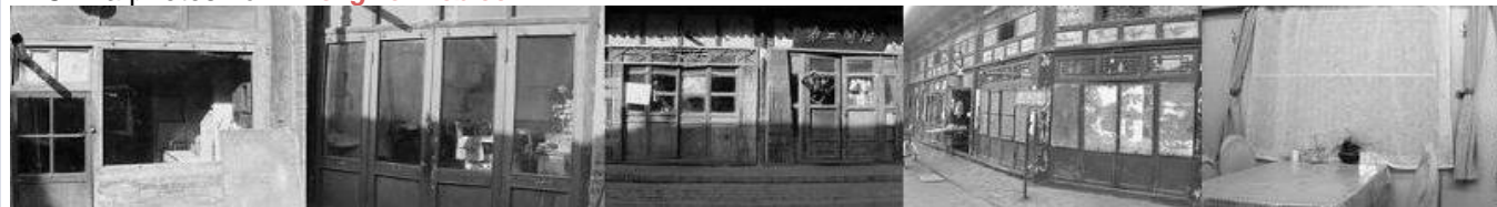
China photos